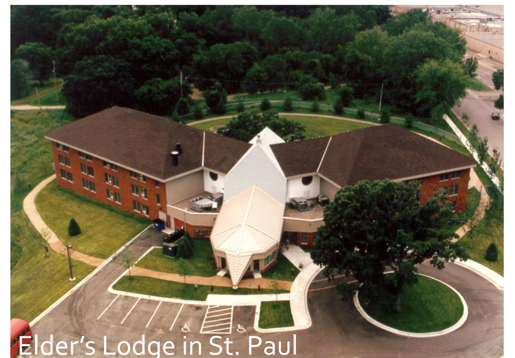
Elder's Lodge in St. Paul